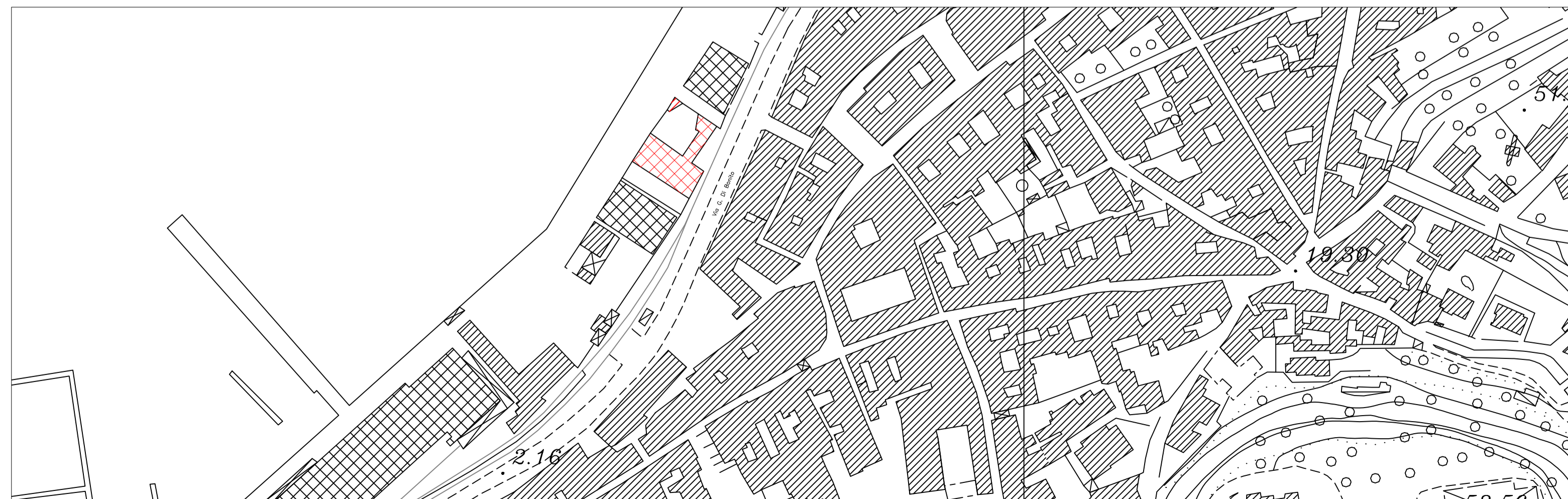
KEY PLAN Scala 1:2000